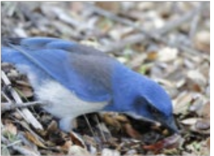
It was a week of excellent birding, good food, and fun friends! If you have never birded Southern California, I highly recommend it.