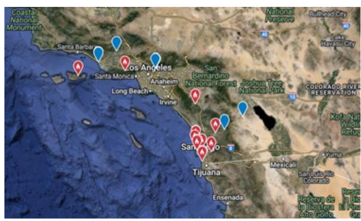
Southern California Birding Trip in March, 2024.